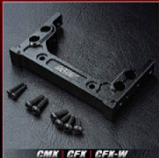
CMX Alum. crossmember A D CMX 鋁合金橫樑 A D