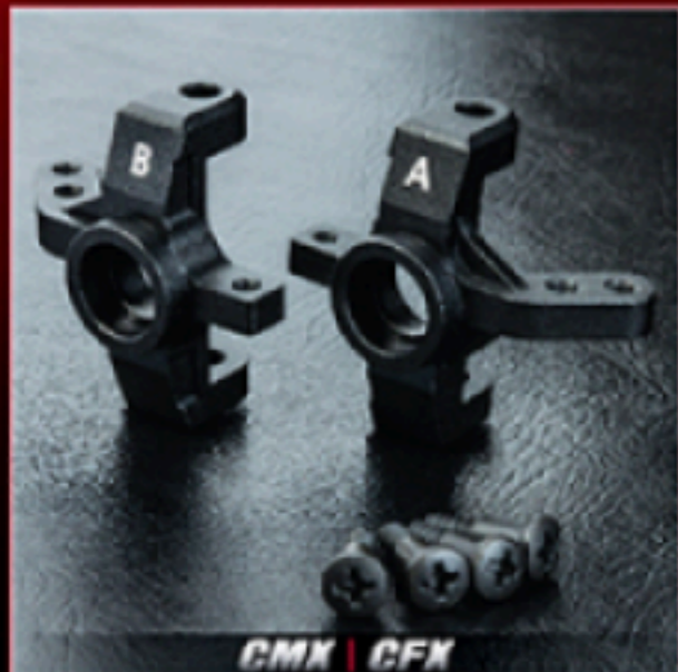
CMX Alum. knuckle (black) CMX 鋁合金轉向座 (黑)