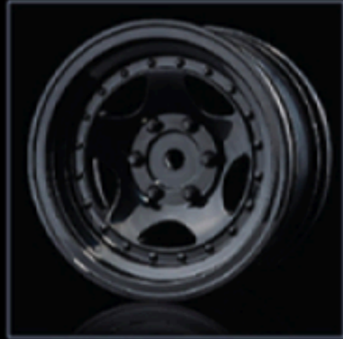
Black 236 1.9" wheel (+5) (4) 黑色 236 1.9" 輪框 (+5) (4)