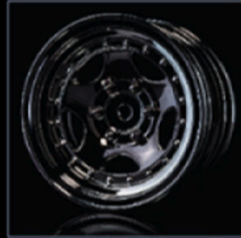
Silver black 236 1.9" wheel (+5) (4) 銀黑 236 1.9" 輪框 (+5) (4)