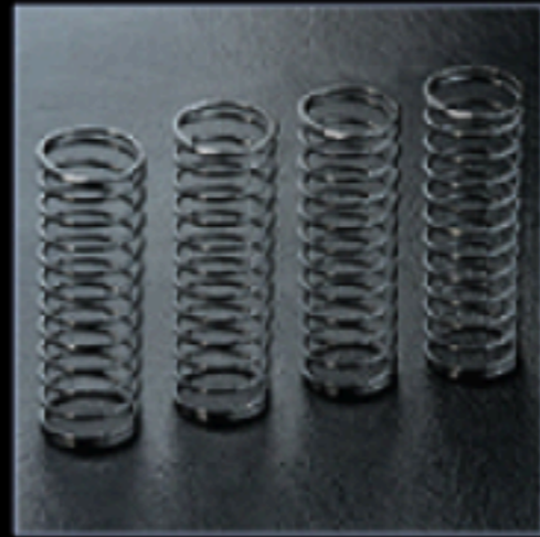
Coil spring 45mm (hard)(silver) (4) 避震彈簧 45mm (硬)(銀)(4)